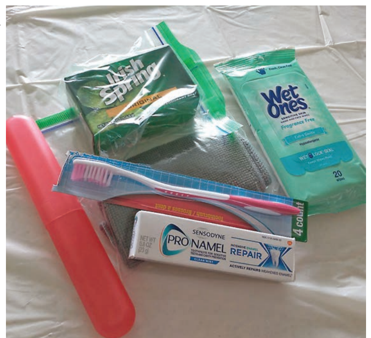
Riverbend News photo by Danny Federico, July 8, 2021

Food kits include enough components to make a meal for a family of four.