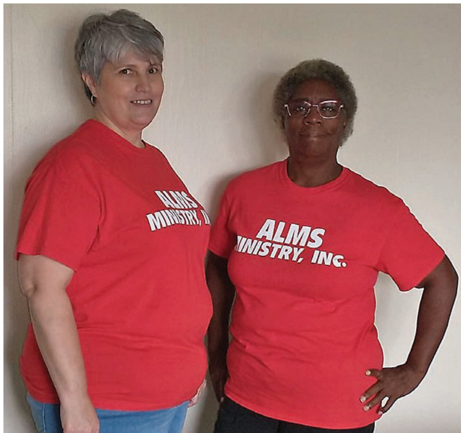
July 8, 2021